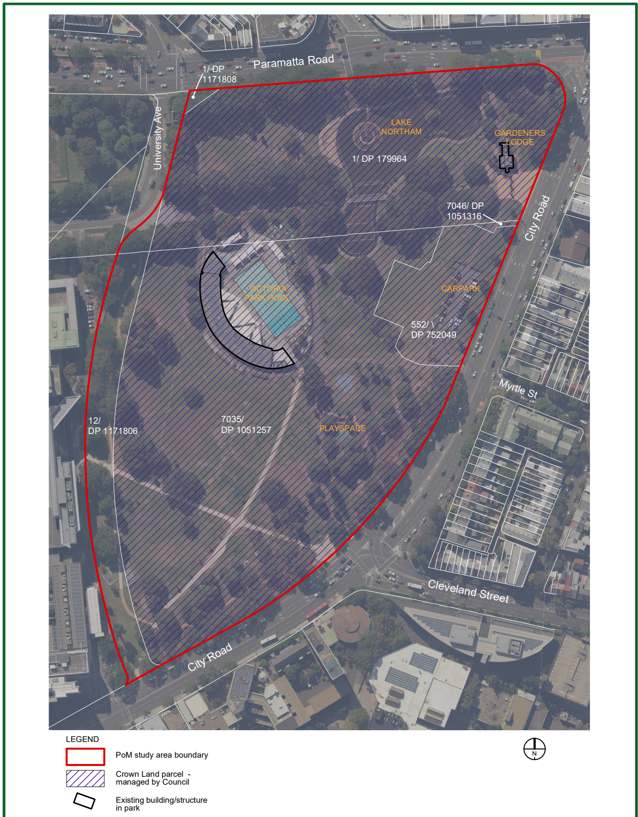
Figure 3. Site Plan