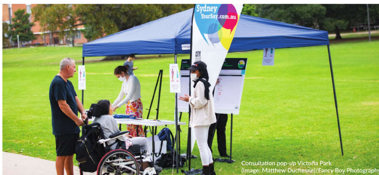
Consultation pop-up Victoria Park