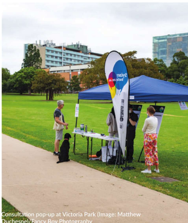
Consultation pop-up at Victoria Park

Participants also told us they value Victoria Park because of the pool and the festivals and major events.