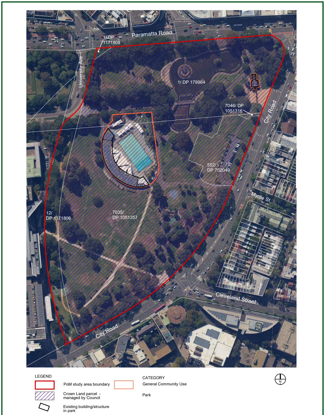
Figure 9. Community land categorisation map