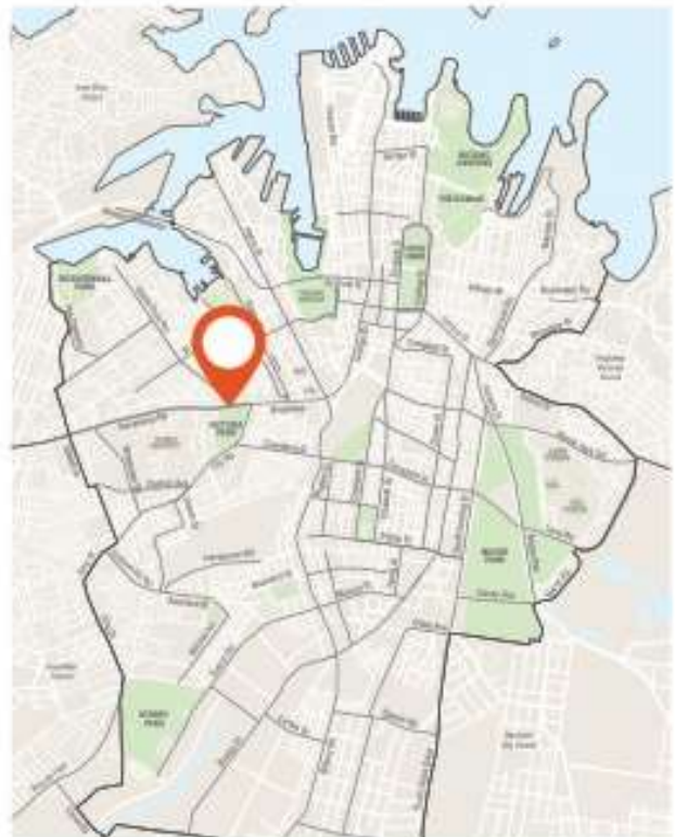
Victoria Park, Camperdown