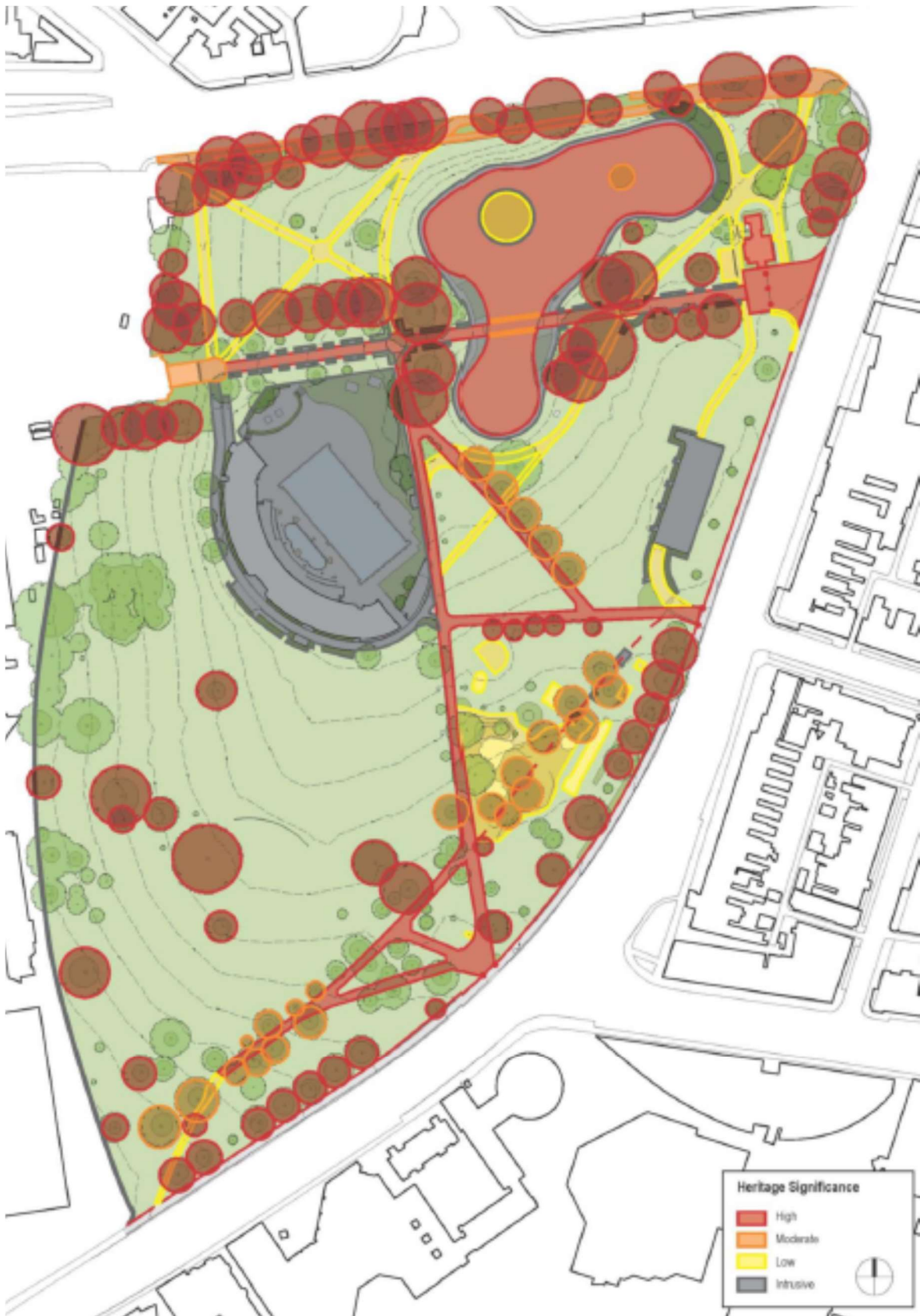
Figure 4. Heritage Significance of Victoria Park